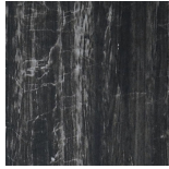
Black Porcelain Gres