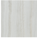
Ivory Porcelain Gres