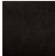
Black Saddle Leather