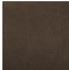
Dark Brown Saddle Leather