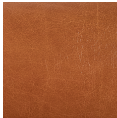
Tan Saddle Leather